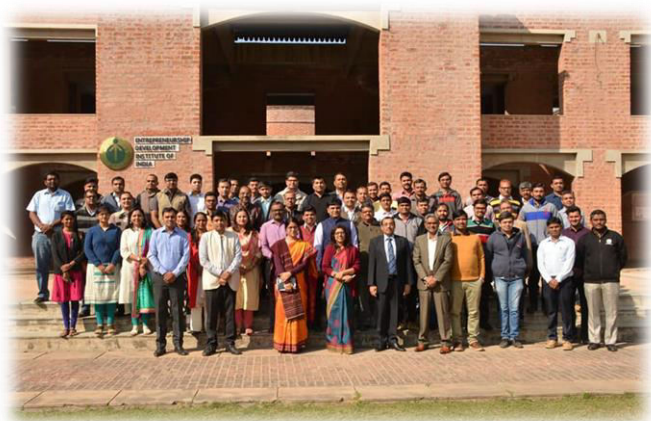
Group photo with three Honourable IAS officers (After inaugural function)