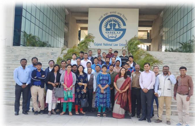
Group photo with all the participants at GNLU (Visit of incubation centre at PDU and GNLU)