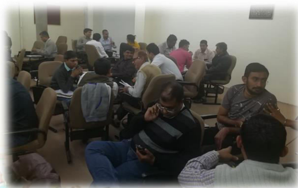
Discussion among group member for the given task