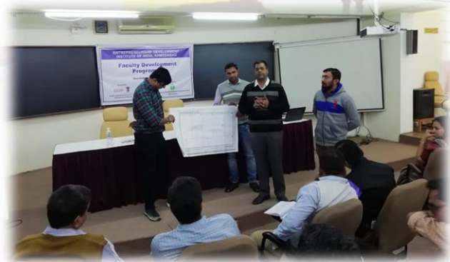
Presenting the start-up task in front of panel