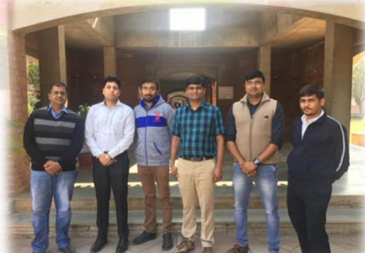
Free timing with group members