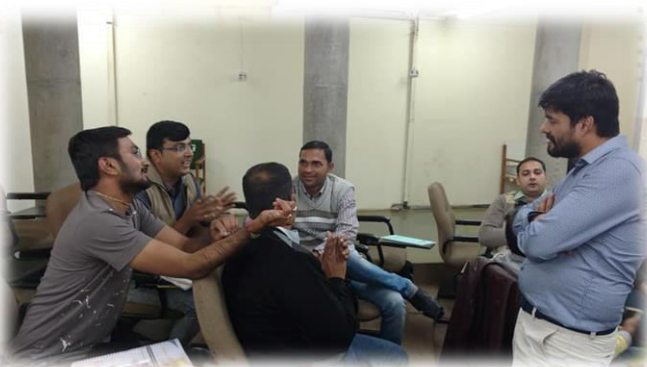
Having discussion with Start-up expert